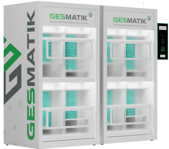
Pictured, 8-select settings